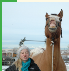
...continued from front

Answer Key: 1. E; 2. D; 3. B; 4. C; 5. A